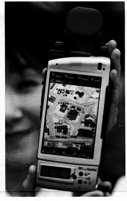
A GPS, Cellphone, Internet and Camera - All in One Device

More recently, a few months ago there was a virus that spread around the world in what seemed like an instant. Once it was stopped it took no longer than 48 hours for the government to find its origin and confiscate computers from the alleged culprit's bedroom. That was great police work right? Yes it was, but what does it mean when a government or some misguided bureaucrat decides to use this