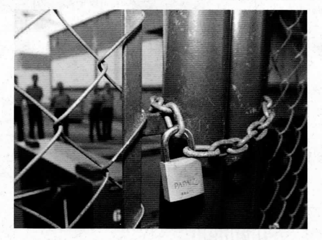
The economy is great - right? Then why are so many jobs being lost each month???

I've concluded that our universities and trade schools are doing a poor job in providing necessary programming resources. If you recall, these are the same institutions that lowered reading and math scores by whole grade levels in the last two decades.